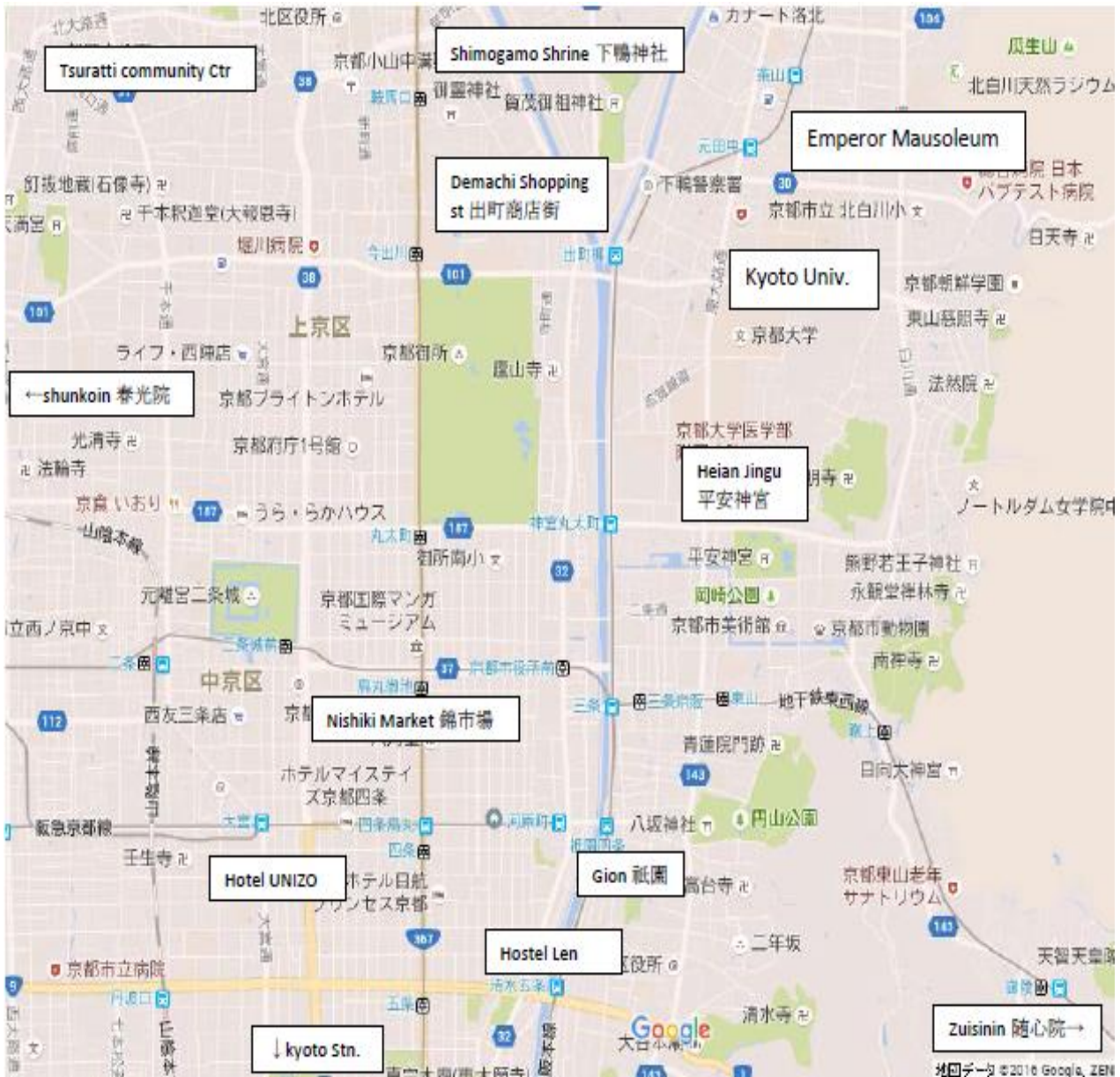
Map of Kyoto City and field research location