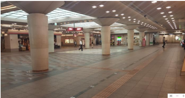
Zest Underground Shopping Street beside Kyoto City Hall Stn.