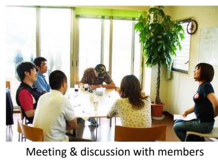
Meeting & discussion with members

Monday to Saturday, from 1day to 5days in a week, trainees work by shift.