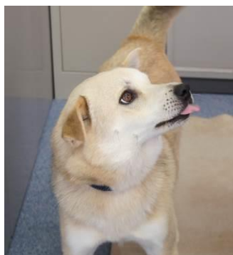
One of our friendly members, called "Mebu", sitting or walking around in the rooms.

We consider self-reliance as a right which must be attained through the efforts of the disabled individual. The disabled tend to be viewed as people who have to be protected. More and more people around them have to understand what the disabled need to be protected and properly supported. On the other hand, the disabled individual is definitely responsible for their own life. Even though the disabled individual has difficulties, they have to be treated as a mature adult, not as a helpless child. As a mature person, they are responsible for what they have done. They have the right even to fail. Mission Karashidane is committed to deal with our trainees as mature and competent people.