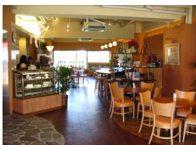
Restaurant 'Café Triangle'

'Karashidane Works' is the name of the place with ideas intending to support and guide the people with mental illness to have independent living and also participation to the community through experiencing various works and training, even if difficult for them to be employed.