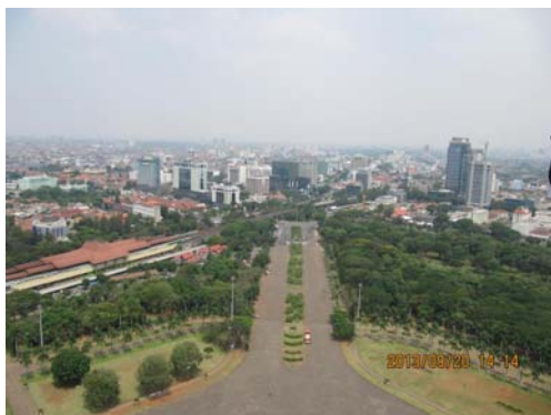
Photo4: part of Yarkata city nearby the railway station

We visited the Japan foundation, Japan education information center, Japan club in Yakarta. We learned most Indonesia students who go oversea elected Australia, but Japan is also popular despite high prices level. In Japan club, we learned the lack of infrastructure is a big problem of firms in Indonesia.