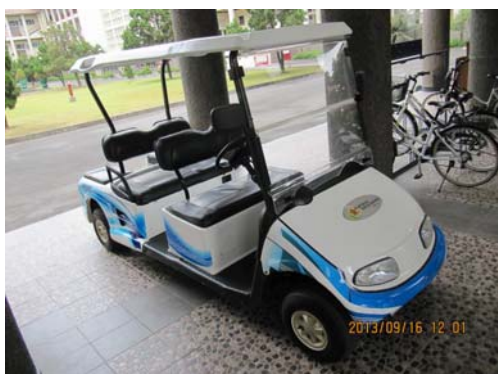
Photo1: the electricity car made by Gadjah Mada University

At first, we visited the historian city of Indonesia, Yogyakarta, where the Gadjah Mada University located. In the university, there was a joint academy assembly of the two universities. At the academy assembly, participants from both universities made a good communication.