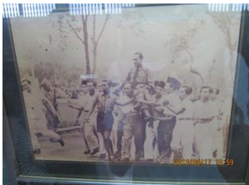
Photo2: people welcomed the former king in Bali island

After the visit of Gadjah Mada University, we visited the palace of Yogyakarta. In the palace, there are many old men guarded the palace and the king as volunteers. We learned the former king is a very good king loved by the people.